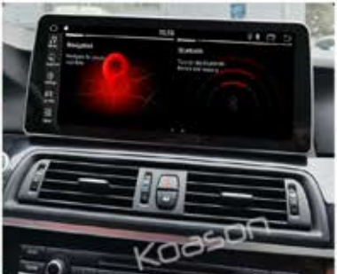
12. 3inch screen after-installation