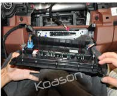
5. Unplug the wire of original CD panel and take off panel.