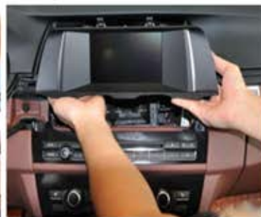
3. Take off the screen.