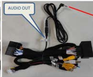
14. Power on car, check if android unit has sound or not, if it has sound, no need to check next step, if no sound, please connect "Audio out" cable into AUX input, check sound again and power off unit if has sound.