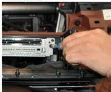
6. Unscrews 2 screws beside CD and take out CD.