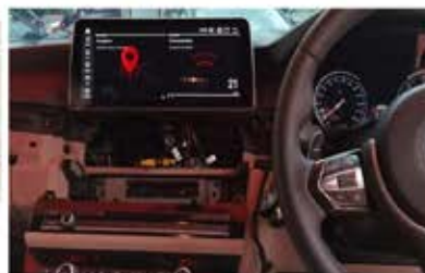
17. Put back CD panel, AC vent trim and android unit, screw up and finish installation.