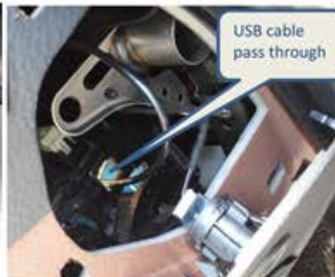
11. USB cable into container, and put SRS cover back.