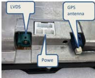
13. Connect original LVDS cable to unit LVDS port, plug power cables of android unit, Note: GPS antenna installed onto the rear windscreen.