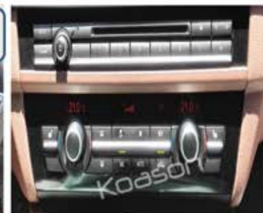
12. Plug the flat cable of original CD panel, put panel and CD back, don't screw it now.