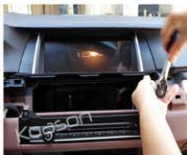
2. Unscrew the screws of original screen and CD .