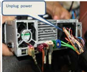
7. Unplug power cable.