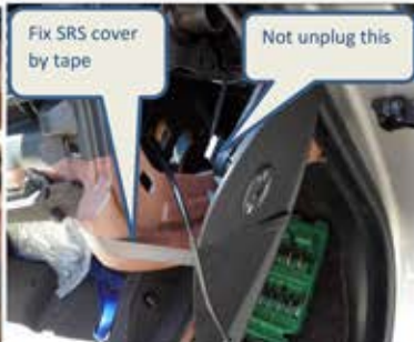
10. Put USB cable into container, bring cable passing through right SRS cover, Note: Fix SRS cover by tape, not unplug flat cable, or else SRS fault code will show up.