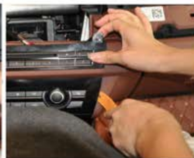
4. Pry up original CD panel.