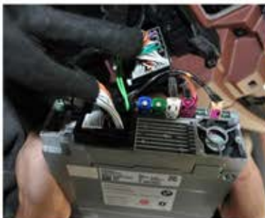
9. Plug power cable into original CD.