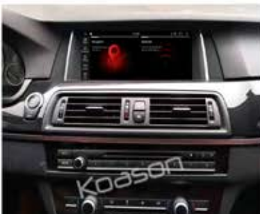
15. Put back CD panel, AC vent trim and android unit, screw up and finish installation. 10. 25inch screen after-installation