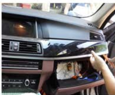
1. Pry up AC vent panel.