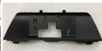
16. if install a 12.3inch screen, please put plastic stand back to original screen place, fix it with screws and wiring android screen and buckle up.