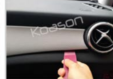
7. Pry the bar out.