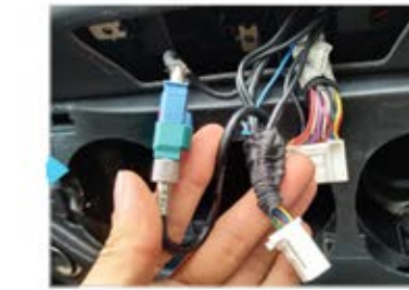
13. Car LVDS plug to android.