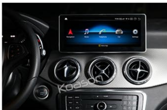
15. Power on, turn on CD, check reverse, radio display, android.