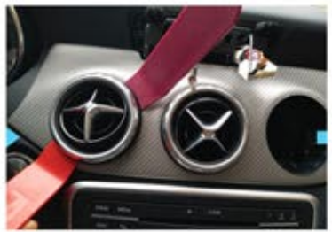
5. Pry up air letout.