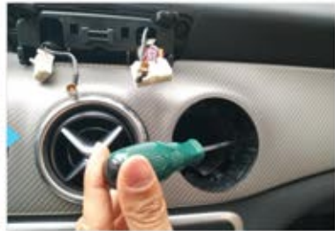
6. Remove screws inside.