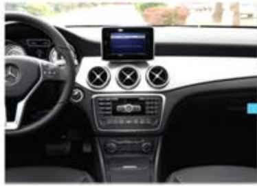
1. Original radio.