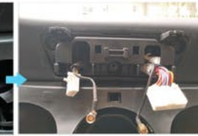
14. Install back the plastic base.