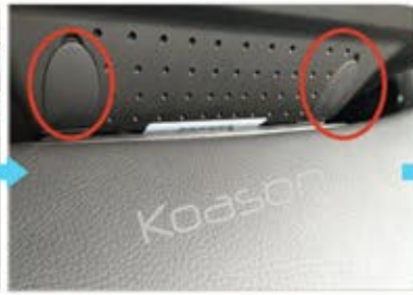
2. Remove screw behind monitor, take monitor out.