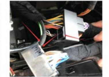
12. Move fiber cable from original to android plug.