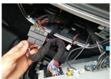
11. Android power cable plug to CD.