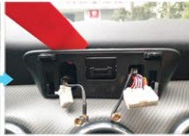
3. Take out the base.