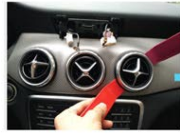
4. Pry up air letout.