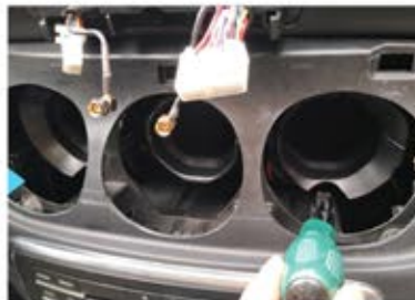
8. Remove screws on CD.