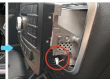
9. Unplug panel cable.