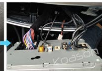
10. Unplug the power cable on CD.