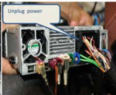
7. Unplug power cable on CD.