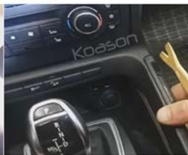
4. Use crowbar to prize up decorative frame of A/C panel.