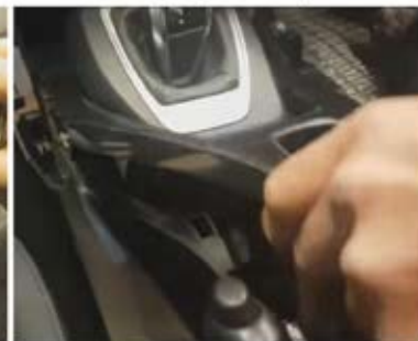
12. Take original knob decorative frame out. (if there is original iDrive knob in car, forget this step)