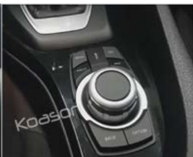
14. The effect picture after iDrive knob installed.