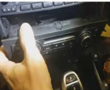
5. Use crowbar to prize up A/C panel and take off flat cable.