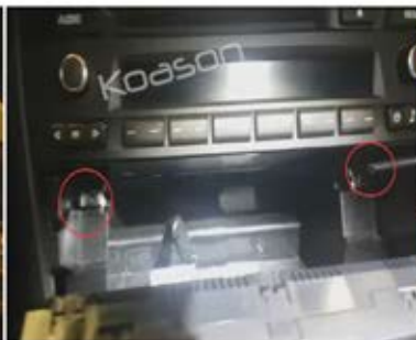
6. Take off the two screws below original CD and pull original CD out.