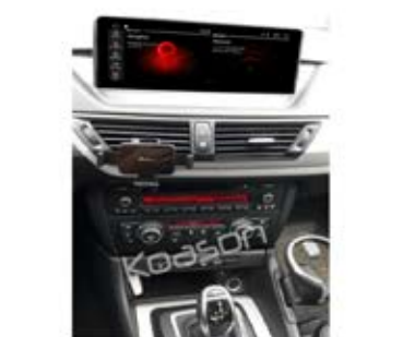
16. Put the original CD, A/C vent back and screw up, installation finish.