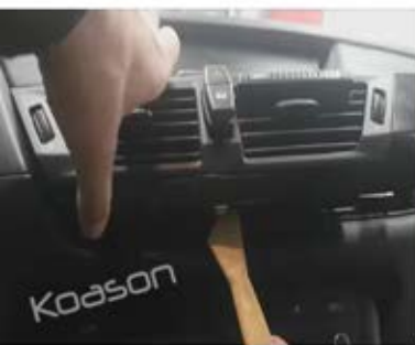
1. Use crowbar to prize up the A/C vent, and take the flat cable out from emergency light key.