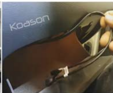
11. Pull USB cable via glove box in passenger seat.