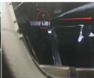
2. Remove 2 screws below car storage compartment or screen display.