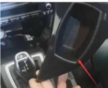
13. Take this box away and put android iDrive knob controller back. (if there is original iDrive knob in car, forget this step)