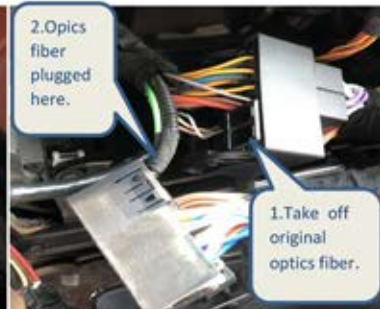
8. Connect power cables together, plug original power cable into the female socket of android power cable. NOTE: Original optics fiber cable move to android male plug at same position.