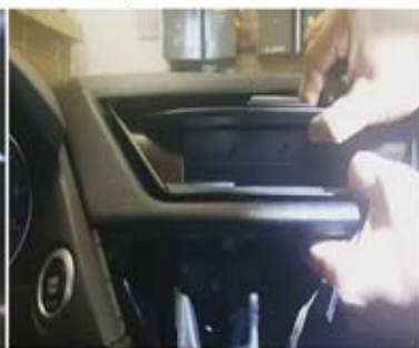
3. Remove storage compartment. Note: It is same dismantling way for X1 with screen)