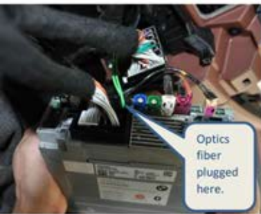
9. Plug android main cable into original CD.